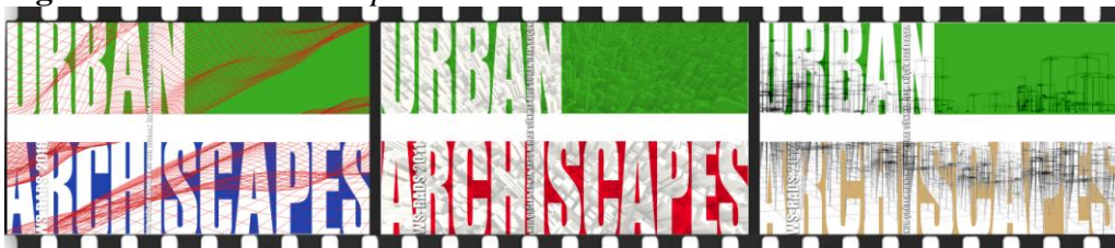
Figure 1. Urban Archiscapes Studio Posters 2010-2011-2012

Within this context this presentation focuses on the research through the creative-productive medium of three experimental Urban Archiscapes Studios materialized in a row in 2010, 2011, 2012 . In the framework of this focus it intends to express the experiential form of research through theme, process, know-how, structure and design products of the studio. Although Urban Archiscapes Studio comprises other design research approaches through its multi-layered working environment, this study focuses on the "research through design" approach. As promoting knowledge acquisition within practice, it is an empirical study.