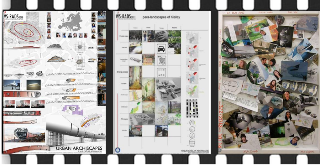
Figure 2. Urban Archiscapes Studio Final Posters 2010-2011-2012

Within the representation environment of the Urban Archiscapes Studio , virtual and real/physical realms of experimentation linked together in order to feed each other in the course of reflection in action through design experiments. Thus, by the way of interrelating the products realized mentally and physically, integrity of perception upon the designated design problem is created.